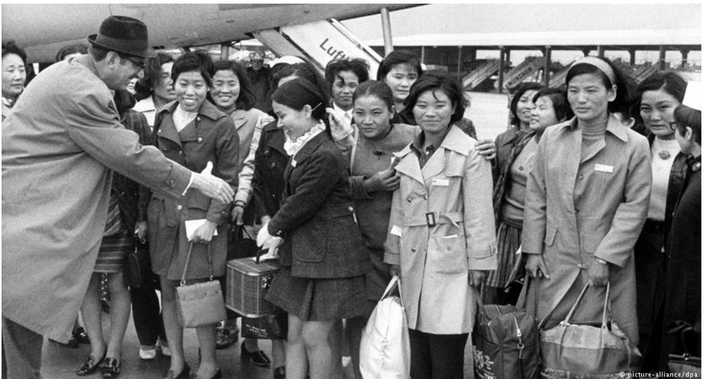
(Korean workers welcomed at Cologne/Bonn Airport in Germany 1966)