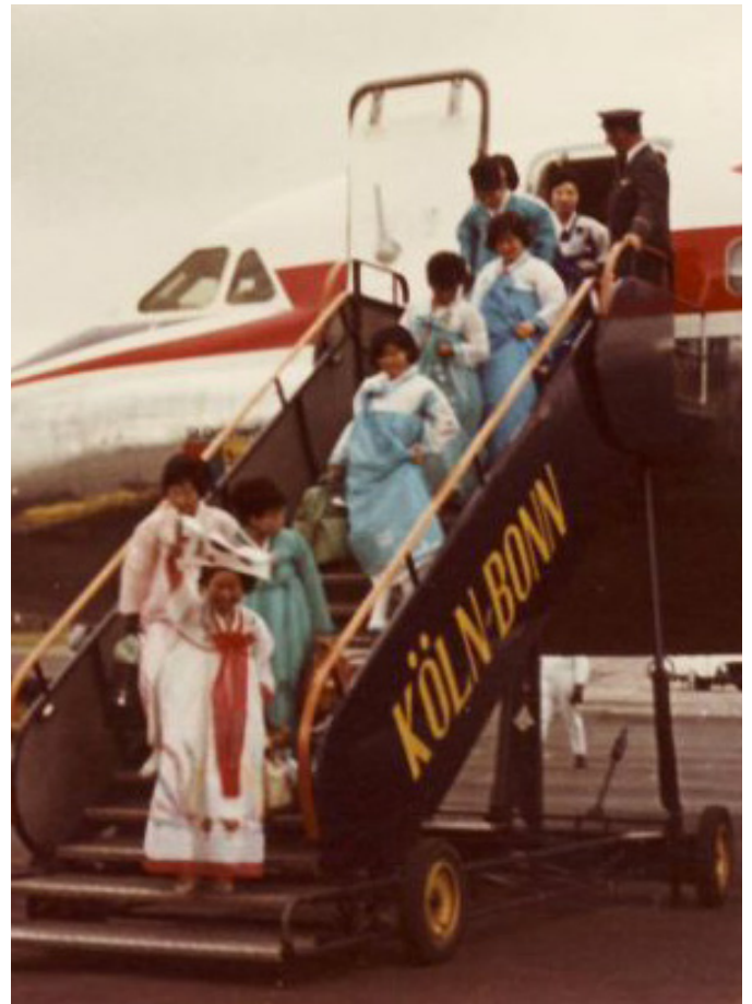
(Korean Nurses arriving at the airport of Cologne/Bonn in Germany 1966)

As Germany becomes more and more cosmopolitan, accepting numerous students and workers as well as refugees, miscellaneous cultures merge together, making the large German cities global hubs. Seeing globalization as the major trend of our community, cases that are similar to Koreans in Germany would become more widely dispersed and dominant.