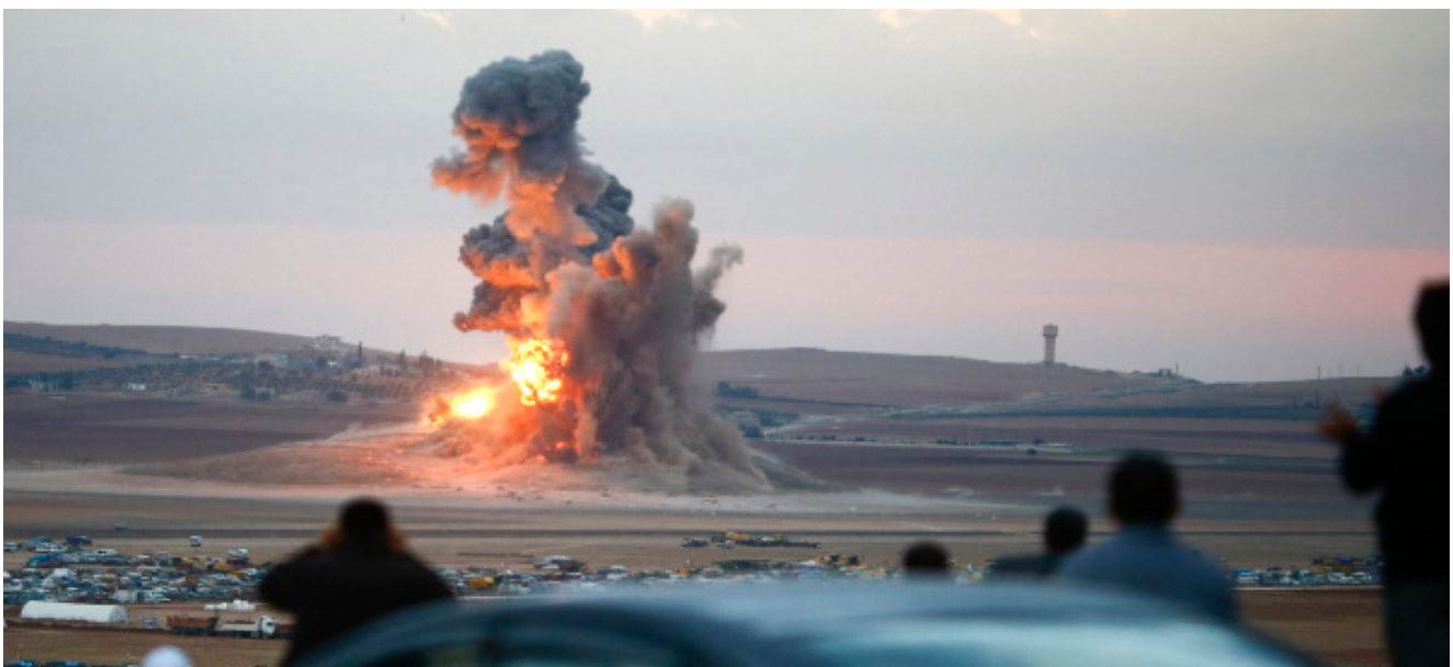
(Coalition Airstrikes against ISIS location in northern Syria)

No course of action however could go forth without addressing some of the key issues that planted the seeds of this crisis in the first place. Thus, our politicians must face the foremost task of ensuring any form of military funding, as well as all resource lines feeding the terrorist group are eradicated completely; fully aware, that this will require scrutiny and forthright dialogue with key allies such as Saudi Arabia and Turkey.